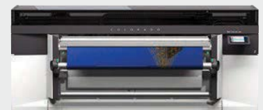
OCÉ COLORADO 1640 PRINTER

The world's fastest 64" roll-to-roll printer