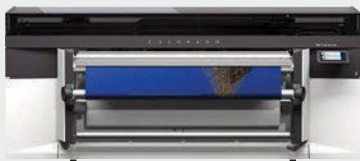
OCÉ COLORADO 1640 PRINTER

OCÉ COLORADO 1640 PRINTER Powered by UVgel Technology